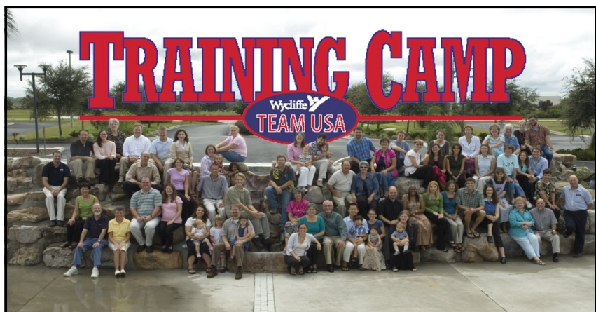
We spent 2 weeks in September at the Wycliffe training camp in Orlando, Florida. Those weeks were jam-packed full of good teaching, exciting stories about God's work around the world, and many opportunities to learn from others who are also passionate about missions.

build a healthy marriage, and contribute to the kingdom of God. We'll pray for you in those areas as well.